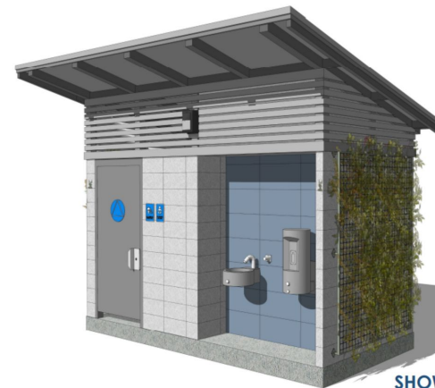
Public Restroom Company ( PRC)